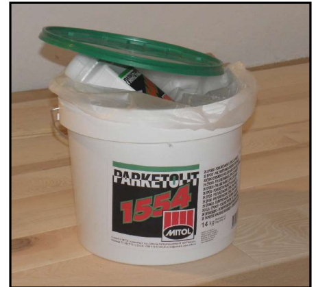
Universal adhesive for all types of parquet on any kind of subfloor.

For more information, please call ++386 573 12 326 or mail to prodaja@mitol.si .