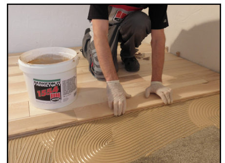
Easy-to-apply, easy-to-clean, long open time.