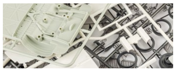
DIFFERENT IDEAS & PROJECTS YOU WORK ON