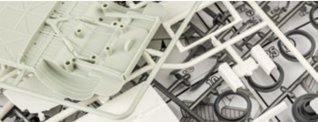
DIFFERENT IDEAS & PROJECTS YOU WORK ON