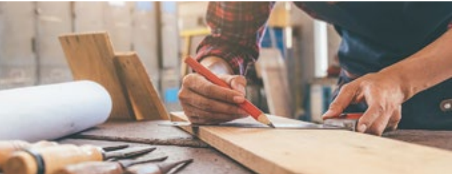
DIFFERENT MATERIALS YOU WORK WITH

There is nothing that can stop your creativity. There is nothing you can't do. And we are here just to help you further develop your dreams and creativity. Our products for "people who make things" are made to last. Make sure you always choose the best product for your project. Start by selecting the characteristics of the glues you are looking for or the materials you work with. You can find our products for: