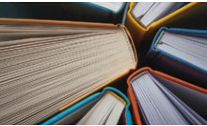
PAPER & BOARD PRODUCTS